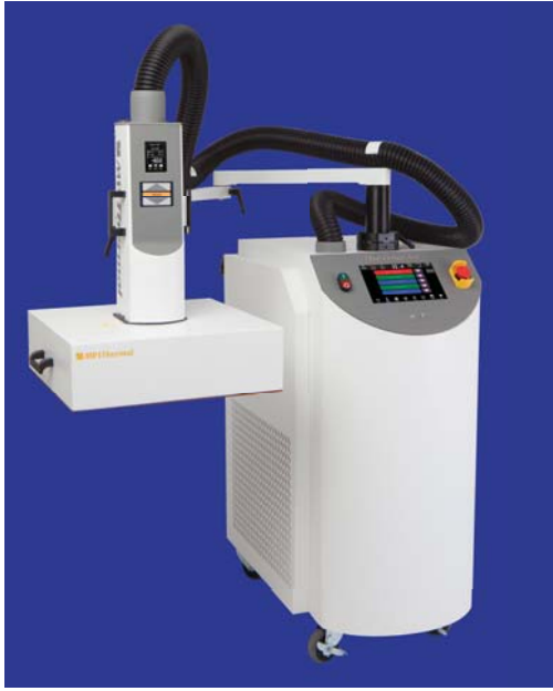
TA-5000A with Compact Chamber Hood