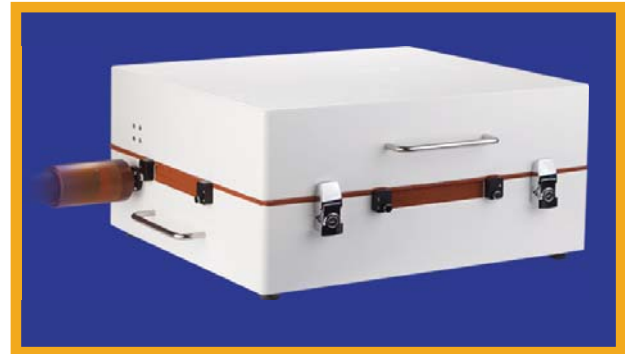
Compact Chamber Clamshell Model

Note: See Compact Chamber Clamshell data sheet