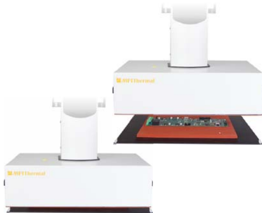
Hood Compact Chamber up/down on test component

ThermalAir 5000 Compact Chamber Hood can be raised up and lowered down over your components under test. Temperature test and cycle your electronic and non-electronic parts and other devices at temperatures from -60° to +200°C with a temperature accuracy and uniformity unmatched by large environmental chambers.