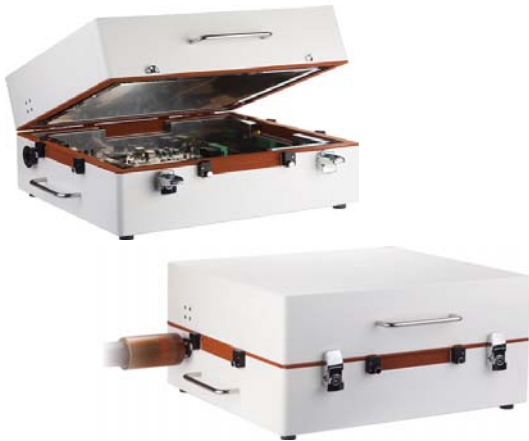
Clamshell Compact Chamber Open/Close Easily