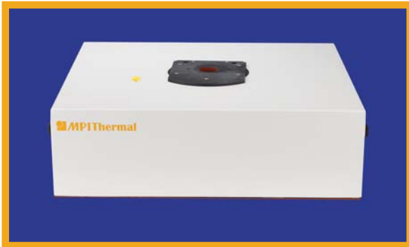
See Compact Chamber Hood Model Chamber Data Sheet