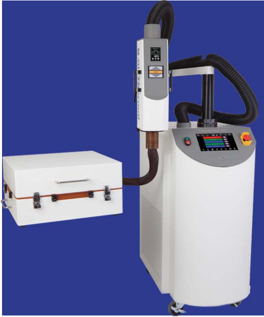
TA-5000A with Compact Chamber Clamshell