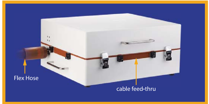
Compact Chamber Clamshell Model Chamber 14Wx16Dx6.2H inches